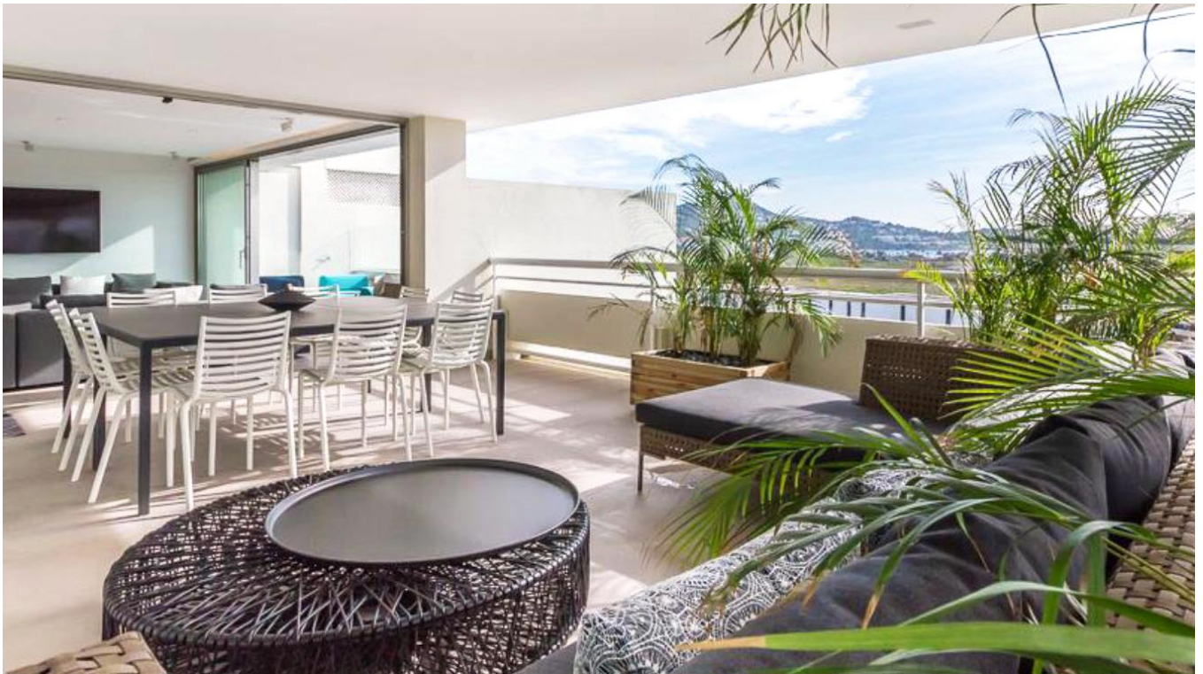
Communal swimming pool.